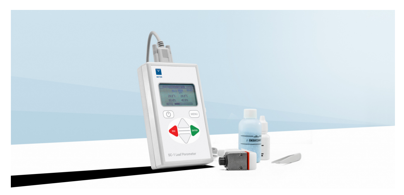
<u>SC-1 leaf porometer</u>The METER measures stomatal conductance

There are not a lot of choices when measuring stomatal conductance. You can't calculate it. Estimating it is possible but not a good method, so a device is used to measure it.